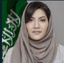
H.R.H. Princess Reema Bint Bandar Al Saud Saudi Ambassador to the United States of America