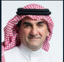
H.E. Yasir Al-Rumayyan Governor of the Public Investment Fund; Chairman of FII Institute

FII Institute is governed by an independent board of trustees made up of civic leaders, entrepreneurial pioneers and noted academicians, entrusted with guiding and empowering the Institute to achieve its mandate from strong ESG foundations, in service of Humanity.