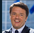
Sen. Matteo Renzi Senator of the Italian Republic; Former Prime Minister of Italy