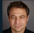
Dr. Peter H. Diamandis Founder & Executive Chairman, XPRIZE Foundation; Executive Founder, Singularity University