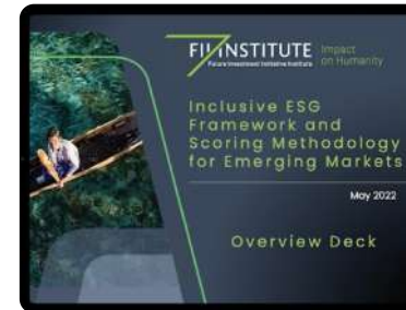
Inclusive ESG Methodology