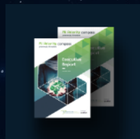
FII PRIORITY Compass & Navigator