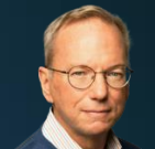
Dr. Eric Schmidt

Founder & CEO, Schmidt Family Foundation; Co-Founder, Schmidt Sciences; Former CEO & Chairman, Google