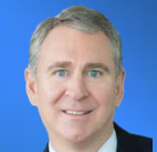
Kenneth C. Griffin

Founder & CEO, Schmidt Family Foundation; Co-Founder, Schmidt Sciences; Former CEO & Chairman, Google