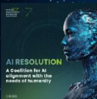
Resolutions on Key Issues