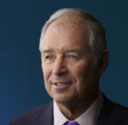
Stephen A. Schwarzman

Co-Founder, Chairman & CEO, The Blackstone Group