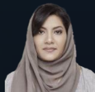
H.R.H. AMBASSADOR REEMA BINT BANDAR AL-SAUD

Governor of the Public Investment Fund; Chairman of FII Institute