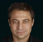
DR. PETER H. DIAMANDIS

Founder & Executive Chairman, XPRIZE Foundation; Executive Founder, Singularity University