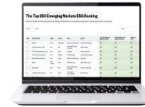
INCLUSIVE ESG SCORE & TOOL