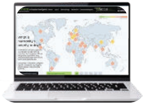
FII PRIORITY Compass & Navigator